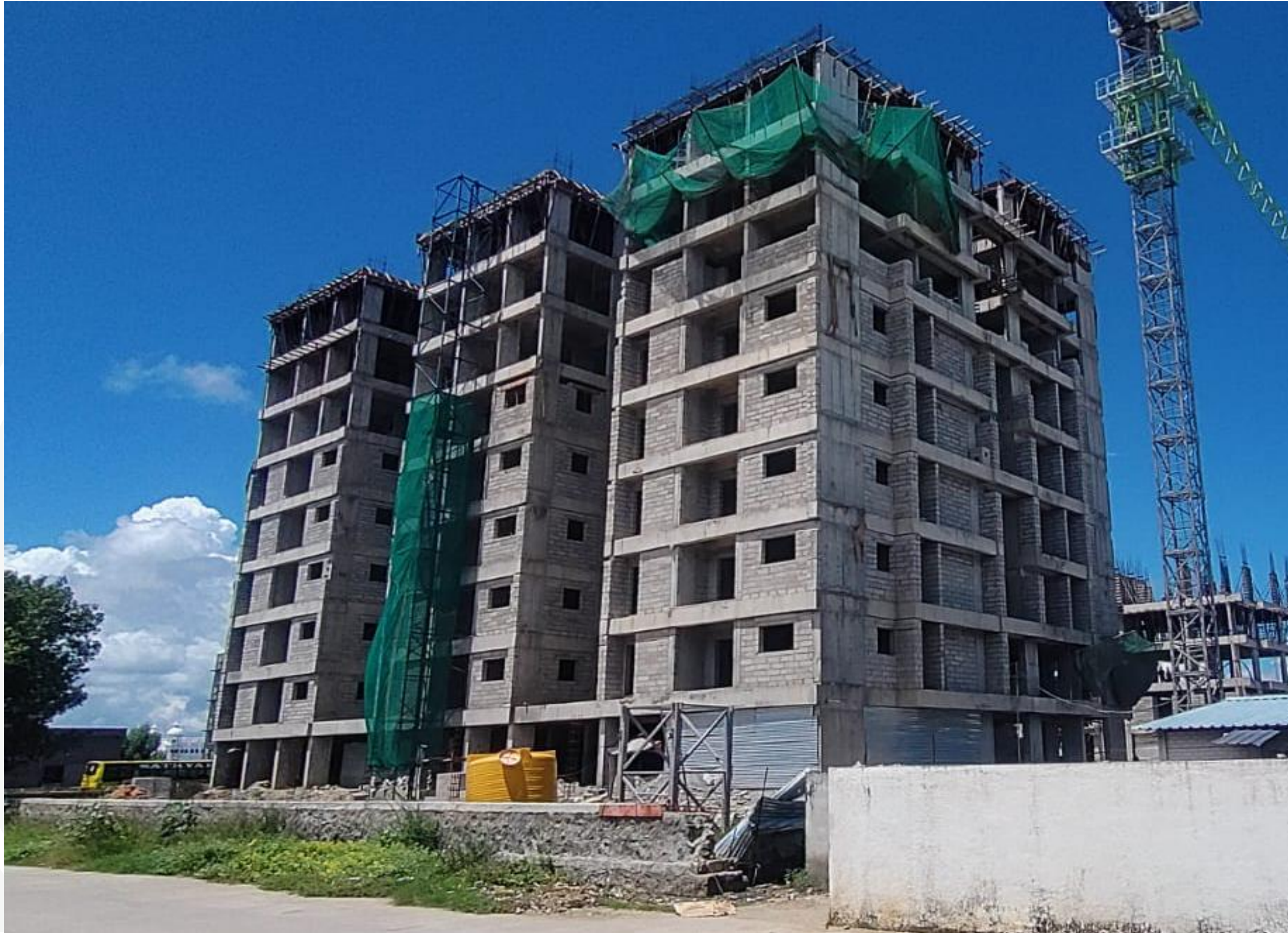
BLOCK 1 – SOUTH SIDE ELEVATION.