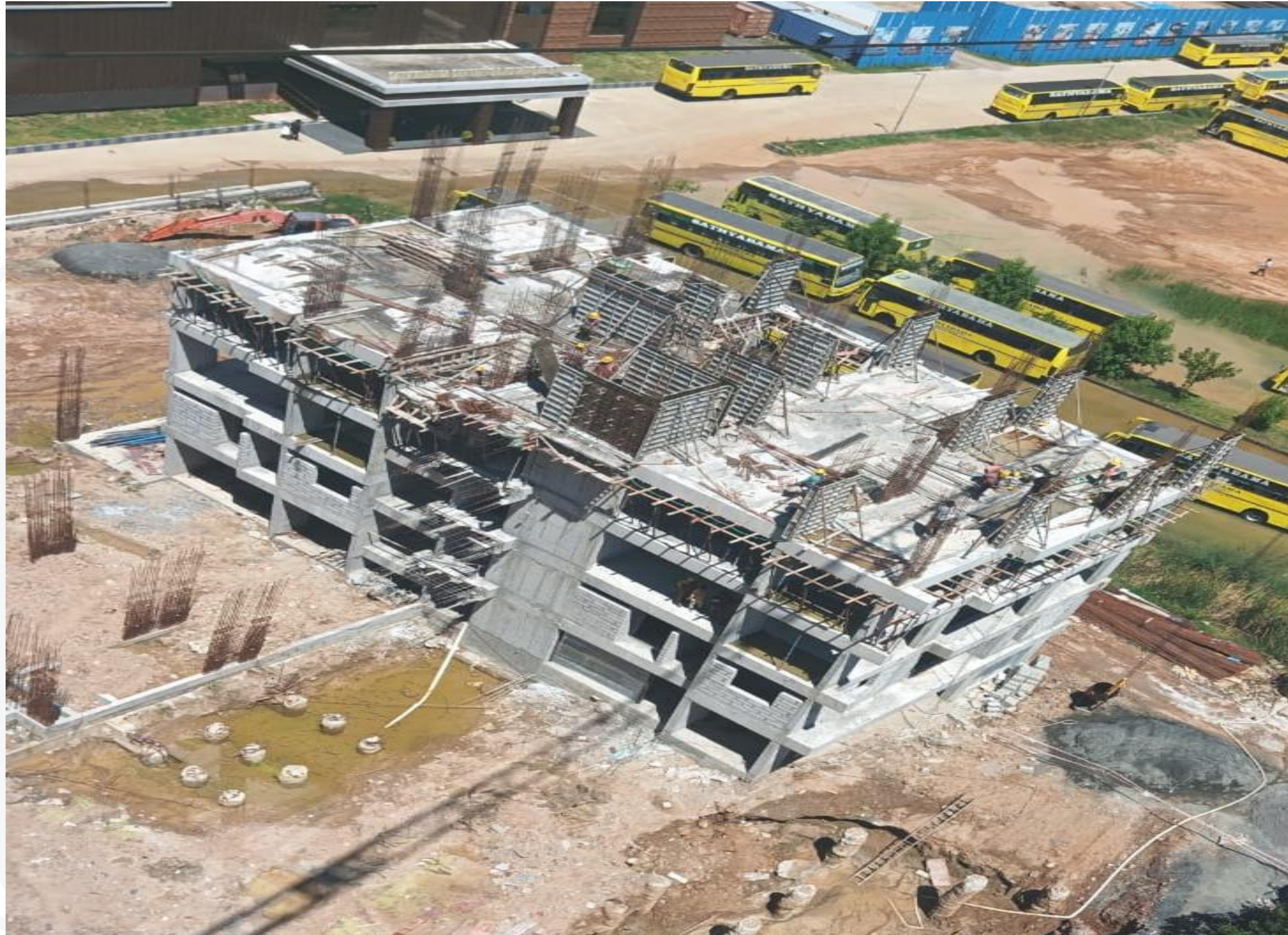
BLOCK 2 TOP VIEW