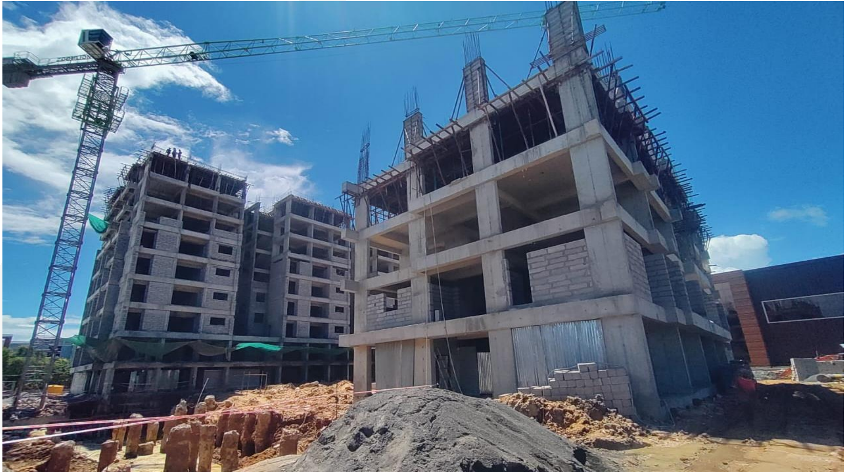
BLOCK 1 – NORTH SIDE ELEVATION.