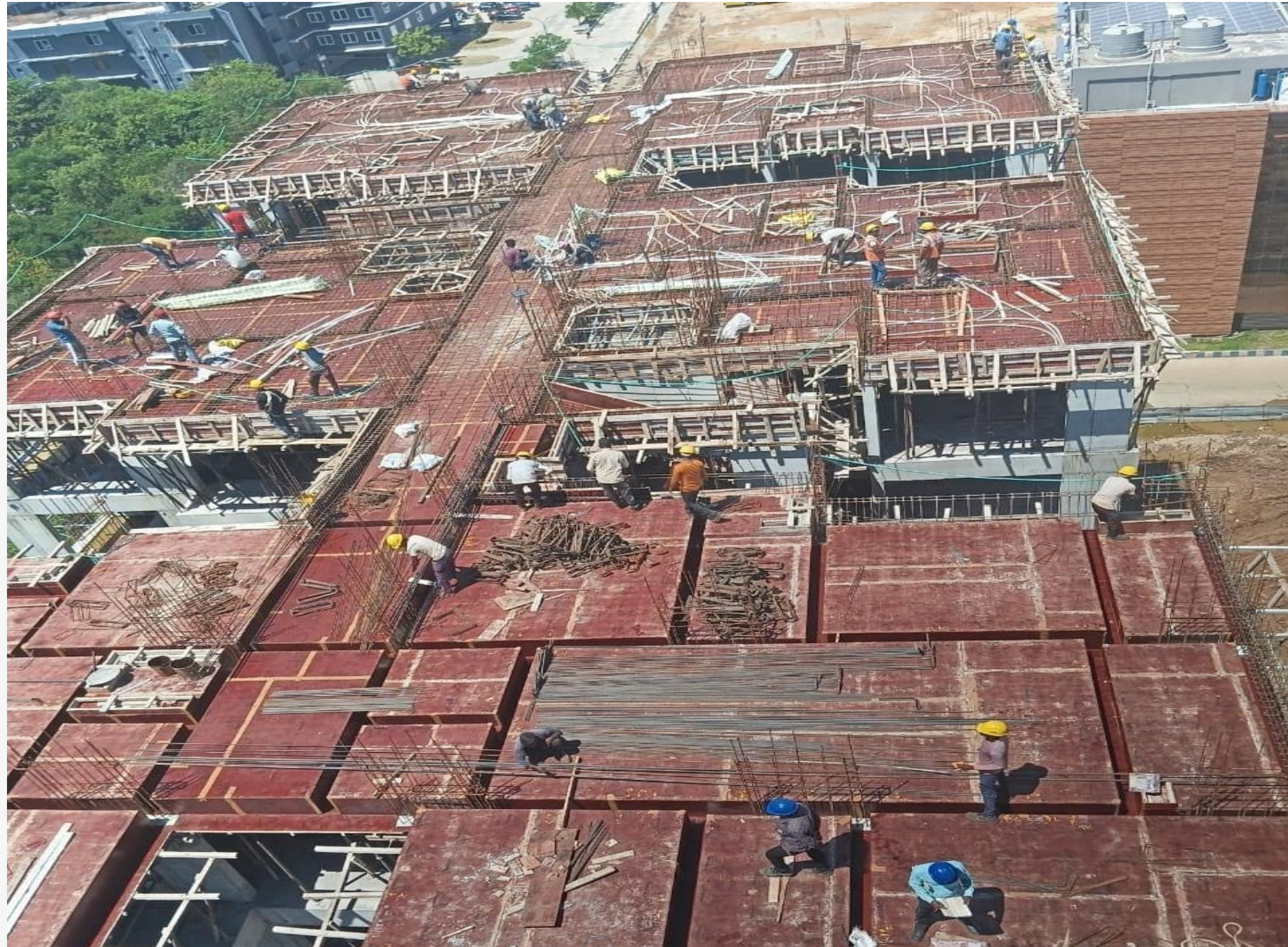
BLOCK 1 TOP VIEW.